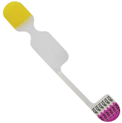
Taylor made through Precise printing, lamination and cutting of an adhesive connector for medical device