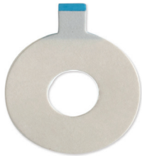
Med-spec mass production of a device/body adhesive connector