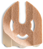
Cut-to-measure adhesive connector of an on-body medical device